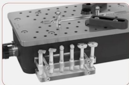
STANDARD SUPPLY DOTAZIONE STANDARD